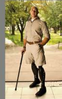
REP Brian Mast